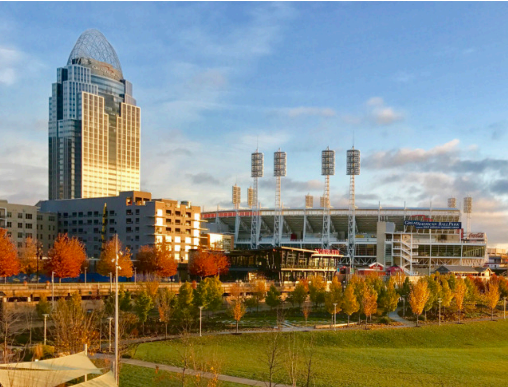
Great American Insurance Group Tower overlooks Great American Ball Park, home of Cincinnati baseball.